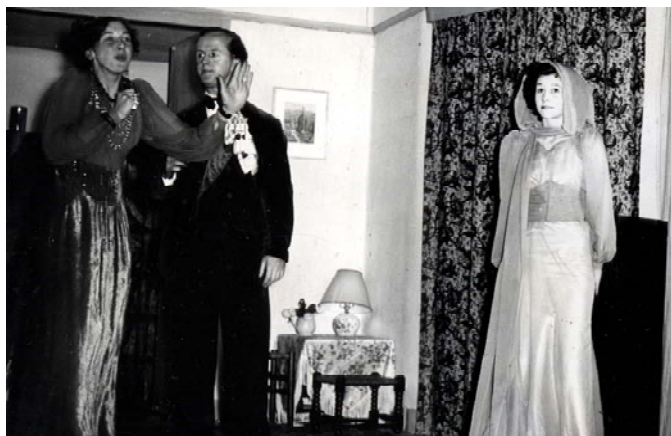
Drama Group 1950

PARKWOOD METHODIST CHURCH AT THE DROP BY CENTRE