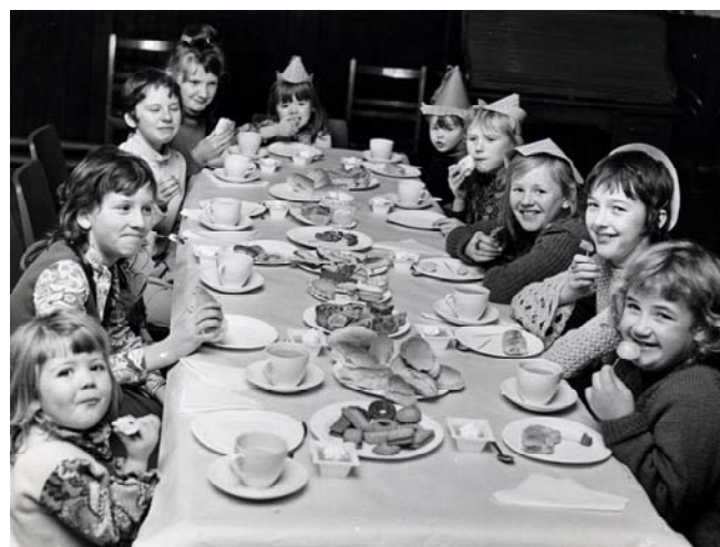
Children's Party 1968

I just hope I don't turn into a Pillar of Salt with this issue!